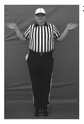
28 Illegal Forward pass Ineligible receiver Both arms extend sideways