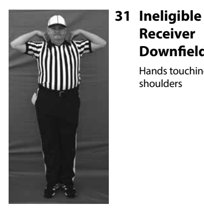
Receiver Downfield Hands touching shoulders