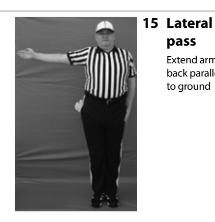
pass Extend arm back parallel